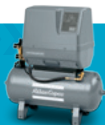
LFx Tank Mounted